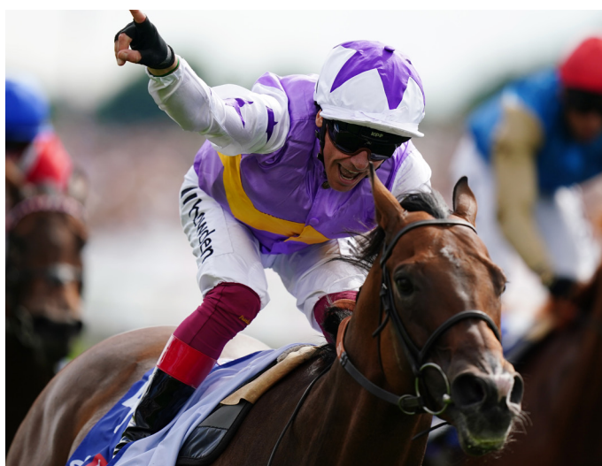
KINROSS (RACE 2)