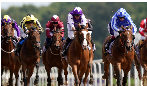
CALLING THE WIND – 2023 WINNER