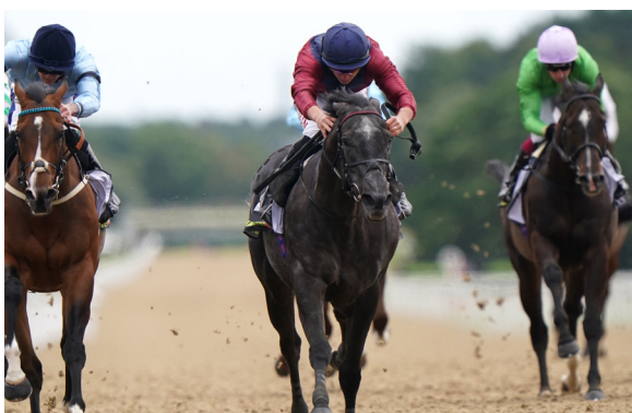
TIBER FLOW – 2023 WINNER

Eight of the last 13 winners had won earlier in the season though and nine of the last ten winners had run no more than three times beforehand during the same campaign.