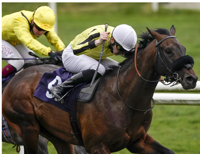
TOO FRIENDLY (RACE 4)