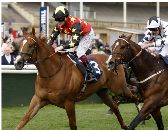
MONTASIBB (RACE 2)

1st BALTIC (13) 2nd SHIFTER (11) 3rd SQUEEZEBOX (6)